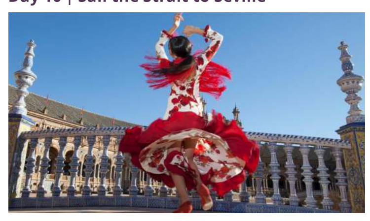
Day 10 | Sail the Strait to Seville

Crossing the Strait of Gibraltar by ferry, we return to Spain and journey past the region of Jerez, renowned as the origin of Spanish sherry. We drive through Andalucía and arrive in Seville. What better way to experience this lively city than witnessing the passion of flamenco? Immerse yourself in the spectacle of colorful swirling skirts and fervent rhythm of castanets during an unforgettable optional Flamenco performance this evening.