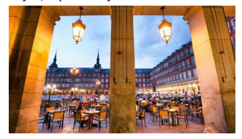
Day 2 | Explore Fiery Madrid

Join your Local Specialist on this day of discovery, which includes views of the iconic Cibeles fountain and Paseo de la Castellana. Admire the Royal Palace and Retiro Park, originally created as a retreat for the royal family, before spending the rest of the day at leisure indulging in la buena vida. Consider an Optional Experience to the medieval UNESCO-listed city of Segovia or encounter the greatest collection of Spanish art in the world at El Prado.