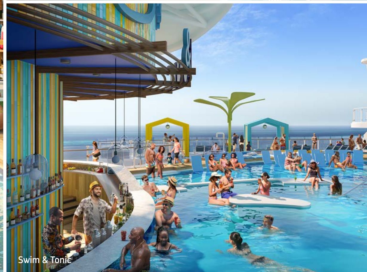
Swim & Tonic