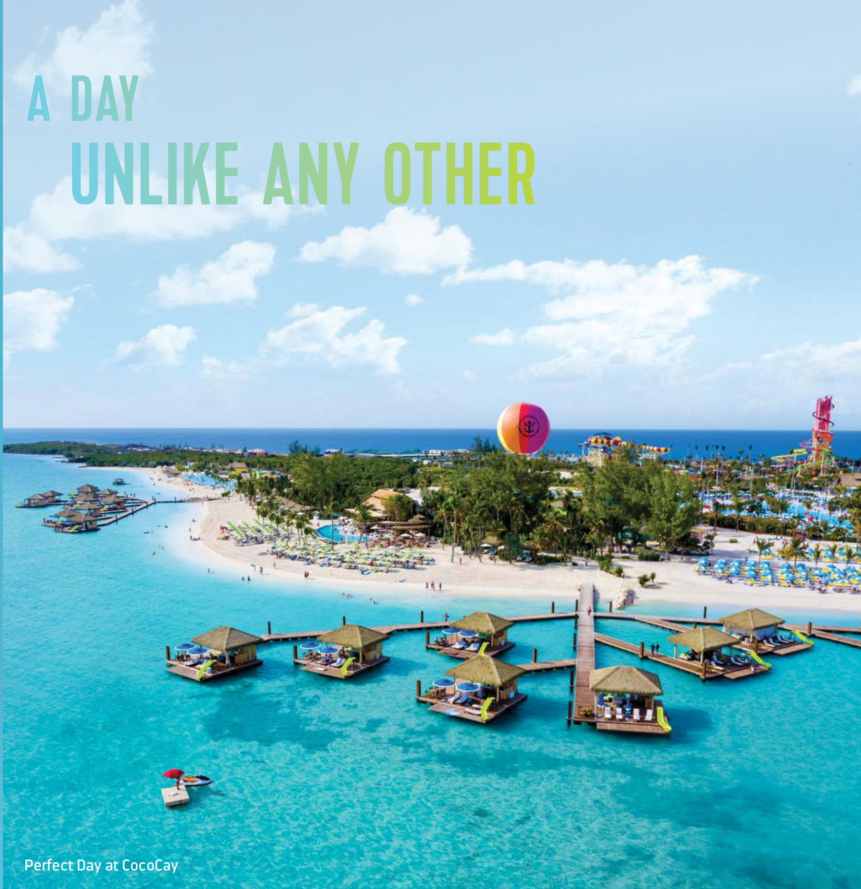
Perfect Day at CocoCay