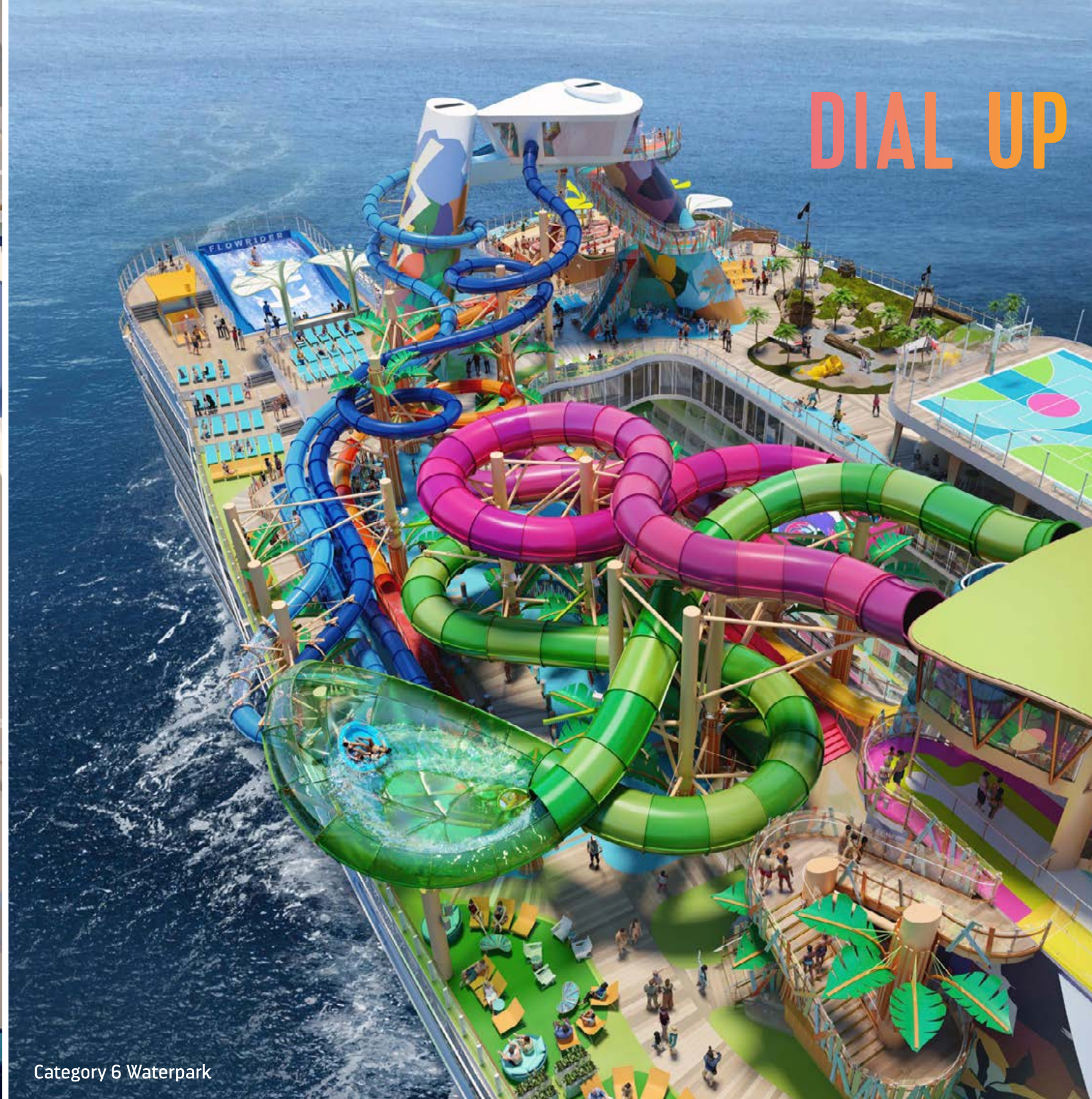
Category 6 Waterpark