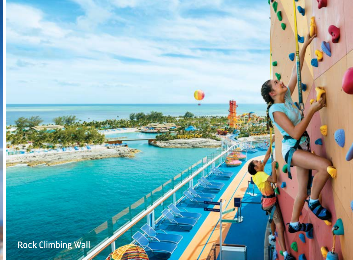
Rock Climbing Wall