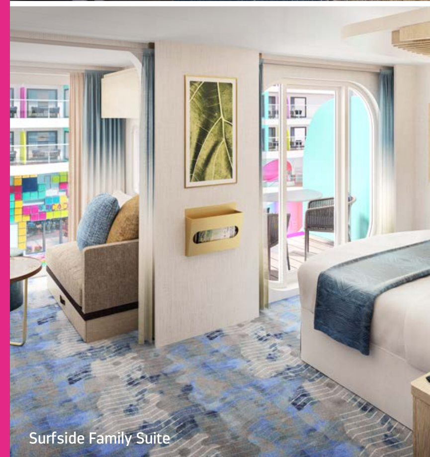
Surfside Family Suite