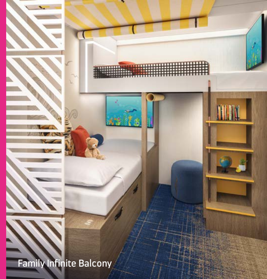
Family Infinite Balcony