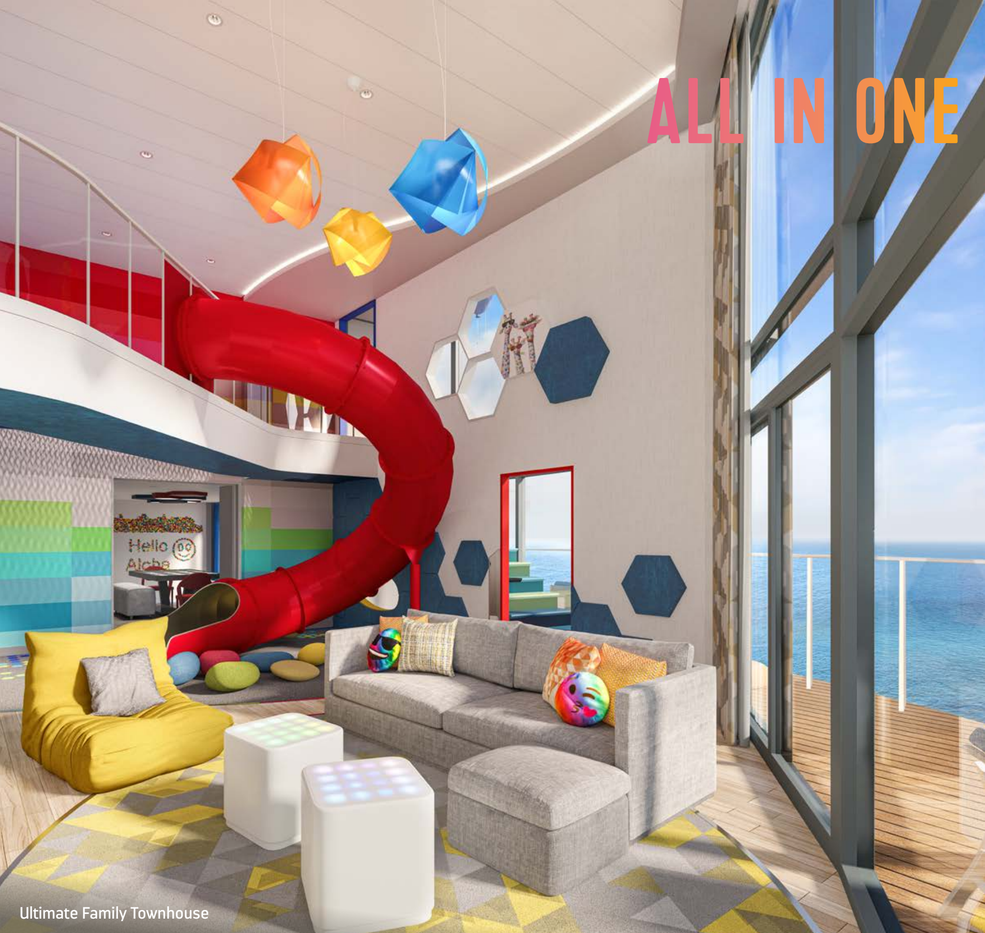
Ultimate Family Townhouse

The Family Infinite Balcony rooms are a kid's dream, where a separate hideaway bunk room gives them their own beds, TVs, and space to chill. Surfside Family Suites are smartly designed to dial up the convenience for everyone — with a spacious split bathroom plus a cozy kids' room.