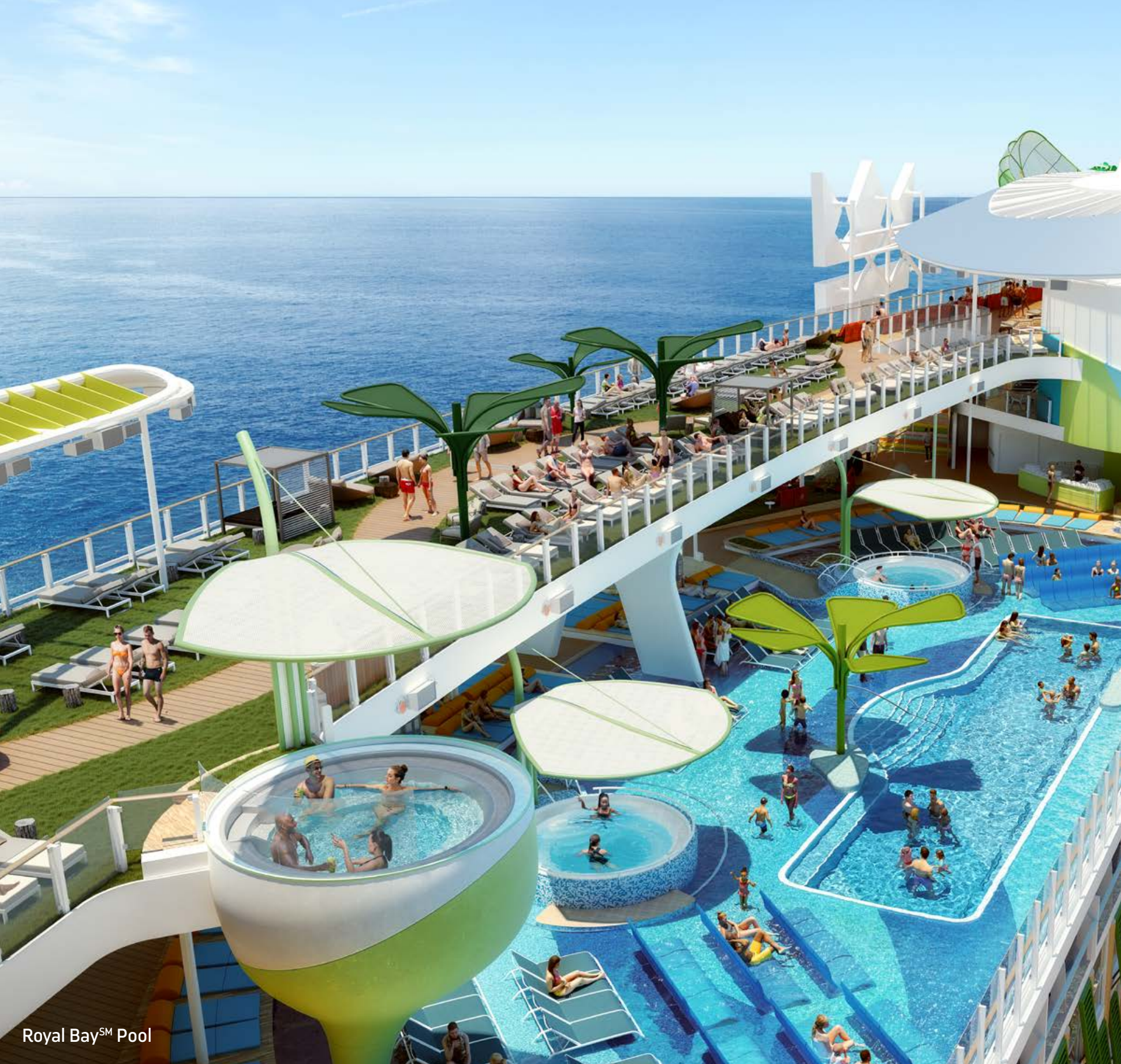
Royal Bay SM Pool