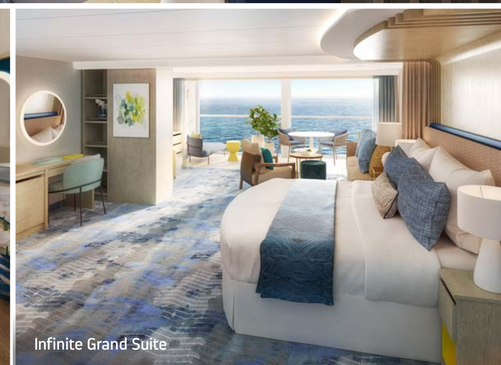
Infinite Grand Suite